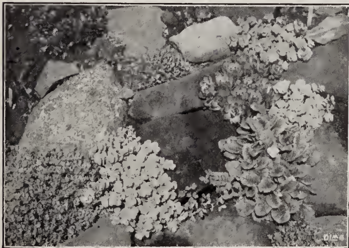
SEDUM IN ROCKERY